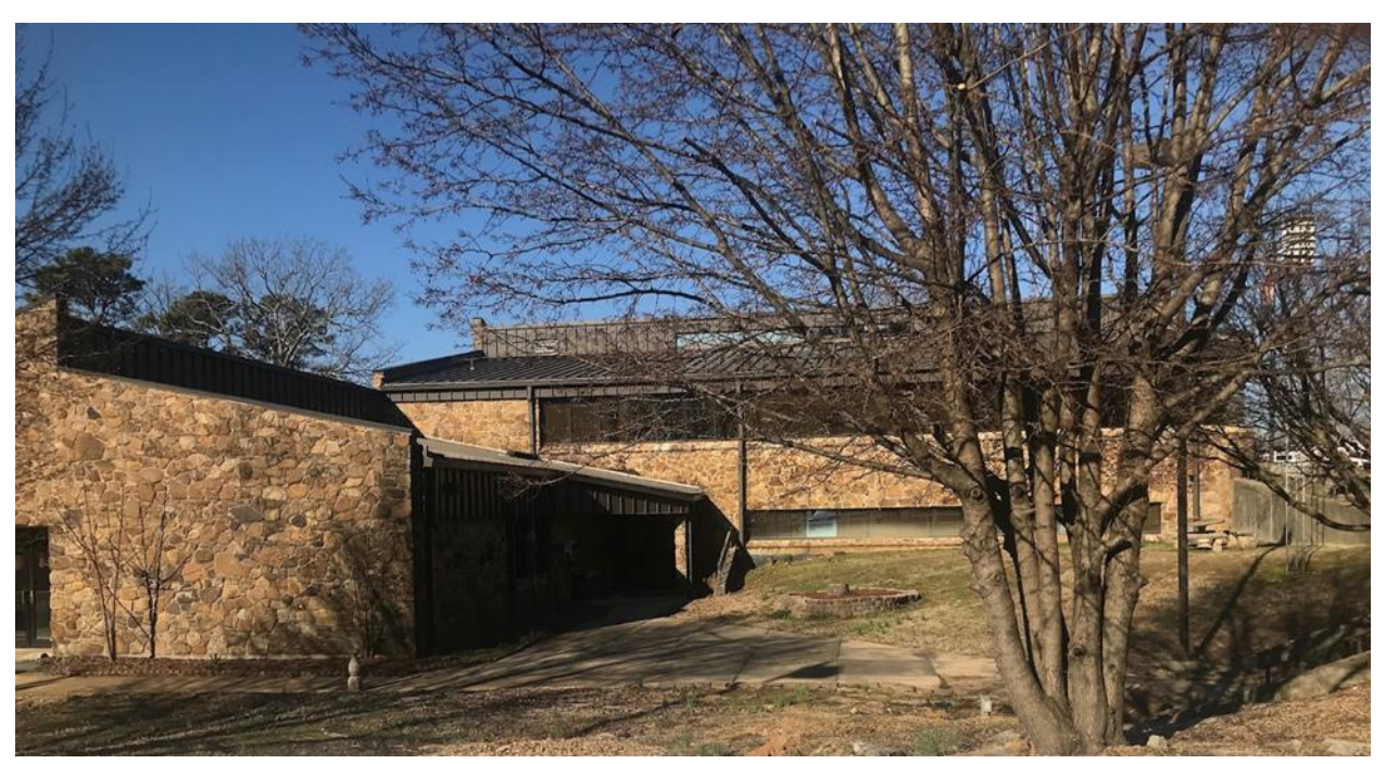
W. E. Sears Youth Center, Missouri (Discussed under Low Incidence Facilities at pp.23 - 26)