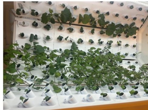
Example of a Hydroponic Garden

Looking ahead, Duncan is particularly excited about the program's future. Thanks to federal funding, plans are underway to construct another building to house the garden. "This will allow us to grow even more, using advanced food production methods," she says. "There's nothing like the quality of produce grown in good soil."