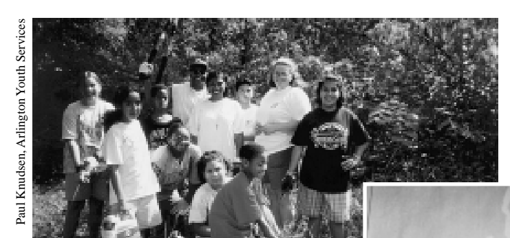
Arlington Teen Center kids do yard work for older residents.

out" is used to discipline a child whose behavior is disruptive. Staff are unambiguously instructed to locate a time out close to the activity in which the infraction occurred. During the time out, the disciplined children are required to sit quietly with their legs crossed and their hands folded in their laps until they are calm enough to rejoin the activity.