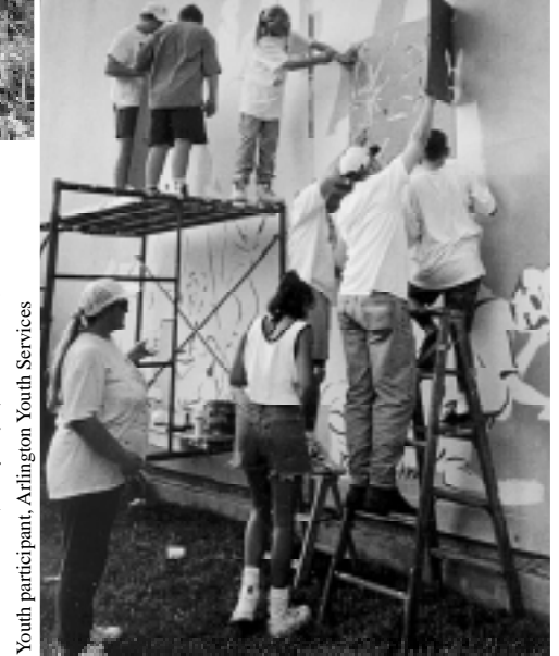
Youth pitch in to brighten up outside of Arlington's Teen Center.

All meet in either the school gymnasium or school cafeteria as soon as school is over, and the activities carried out by the children involve a choice of age-appropriate physical exercise (such as circle games for the youngest children and tether ball or relay races for the oldest), arts and crafts for fostering fine motor skills, board games for broadening intellectual skills, and cooperative projects for developing social skills. Younger children ask for and receive more individual attention from the staff than children approaching adolescence, who are more interested in communicating with each other. With the occasional exception of a child who has been assigned to a solitary, short time out for breaking a rule known to all participants (such as pushing or shoving), and a num-