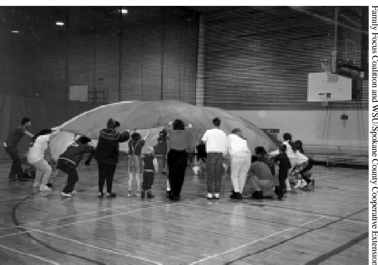
After-school activity at West Central Community Center features team-building game.

In response to this lack, the Girl Scout Council adopted innovative procedures to meet the needs of girls and to introduce neighborhood families to the benefits of Girl Scouting. A professional staff member is organizing and leading troop