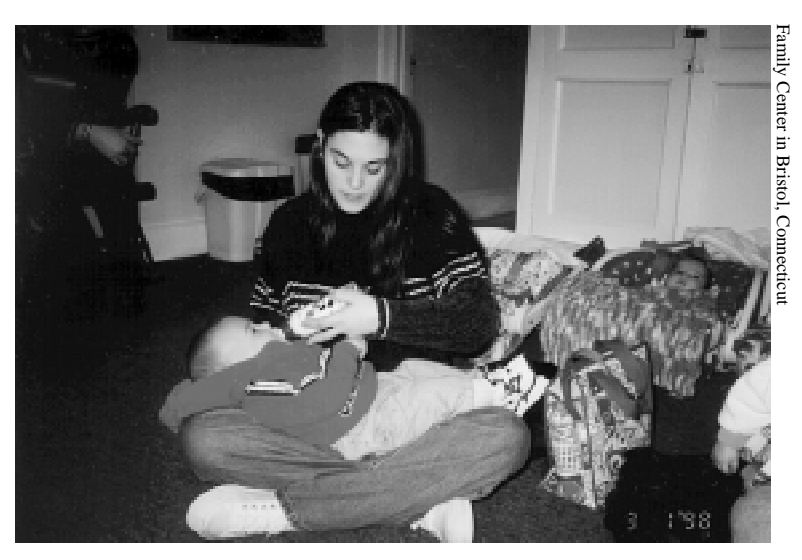
Teen mom gains positive support at Bristol's Family Center.

Frequently, typical adolescent stresses come to the fore—emotional stresses such as the need to establish an independent identity leading to conflicts with their own mothers and fathers; social affairs involving boy friends, best friends, and dating; and academic subjects involving future career choices. To address these concerns, trained Family Center staff provide case management and individual counseling. Close and