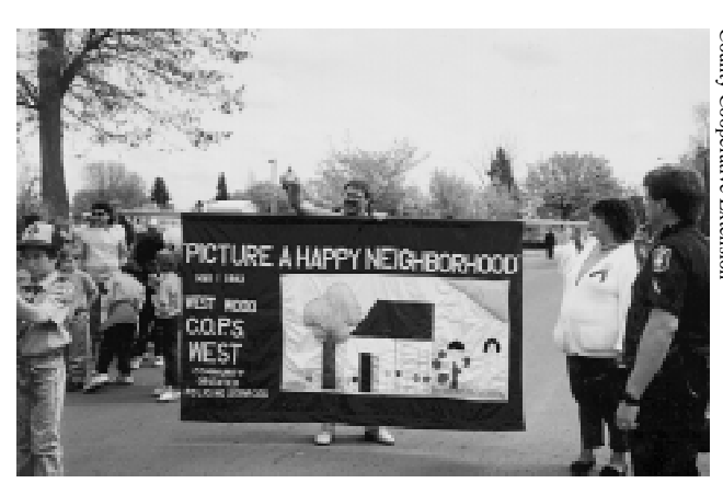
"COPS West Neighbor Days" parade features quilt made by COPS West volunteers from an elementary school student's design.

Key to Spokane's community policing approach is the chief's strong encouragement of actions by officers that go well beyond traditional law enforcement and crime prevention approaches, particular those addressing problems involving Spokane's children and teens. As a result of the motivation