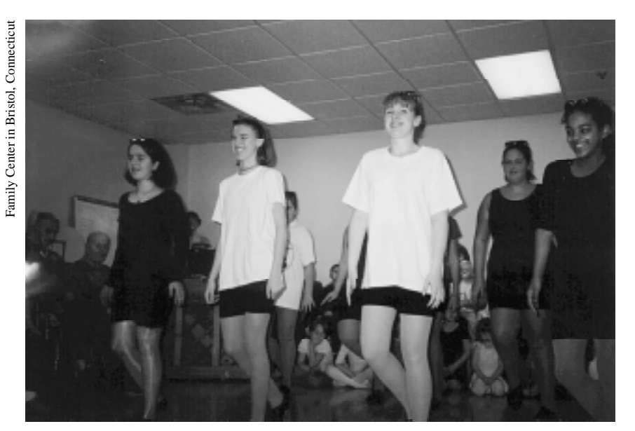
Family Center girls put on a show for seniors.

The primary means of implementing these approaches was through: