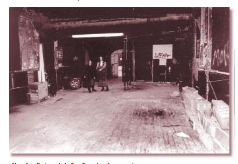
Site of La Bodega de la Familia before its renovation.

Word of mouth in the Loisaida is integral to La Bodega's success. La Bodega relies on its reputation within the community to promote participation. The number of referrals to the center from neighborhood residents is increasing. La Bodega also enlists the community