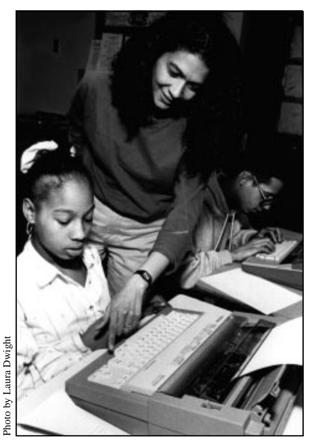
Children develop skills for the future.

condition they left them the day before. When chalk and erasers disappear and are replaced with pizza boxes and other items, teachers are understandably upset. Beacons have had to find ways to ensure that program participants respect the need to maintain classrooms in the condition they were found. A number of Beacons have monitors check all the rooms at the end of each evening to confirm that everything is in order. One program has purchased a supply of chalk and erasers for the school to ensure that these critical supplies are available for teachers.