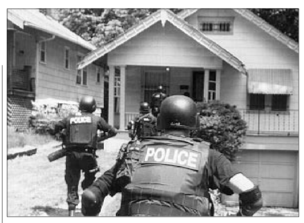
A team from the Street Narcotics Unit of the Kansas City Police Department conducts a raid on a drug house.

■ More than 100,000 students have participated in drug-abuse prevention programs.