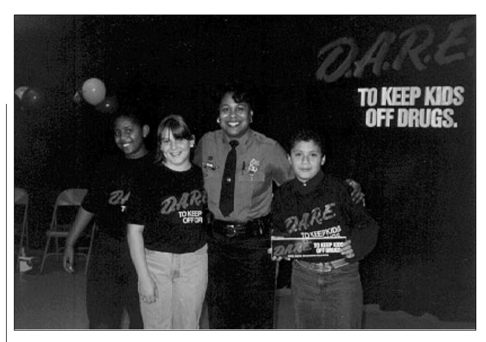
Fifth-grade students with their police instructor in the D.A.R.E. program.

The third objective focuses on preventing youths from ever becoming