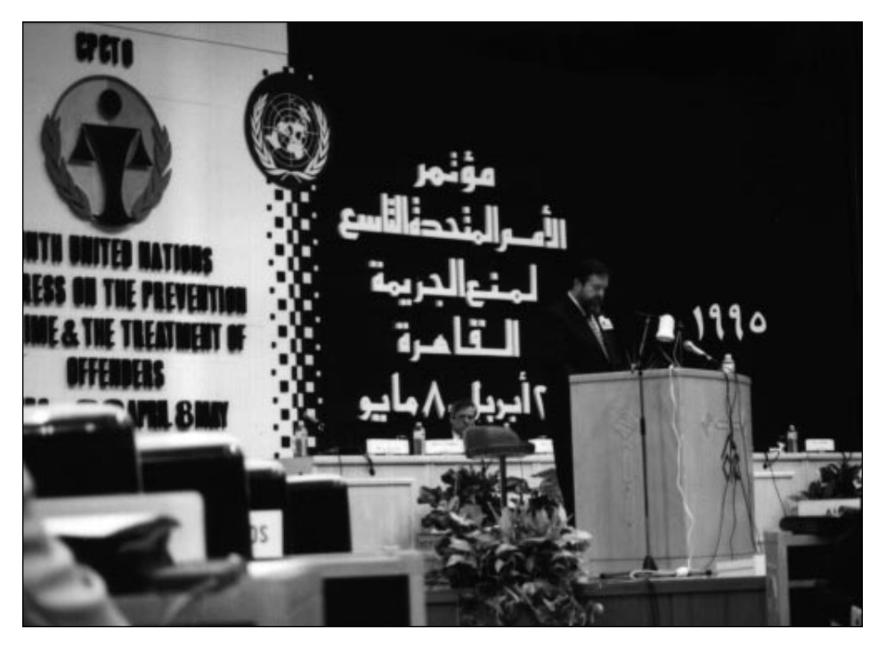
At the Cairo U.N. Crime Branch Congress, 1995.

of the Internet. Software packages containing everything needed to connect to and use the Internet will be made available at no cost.