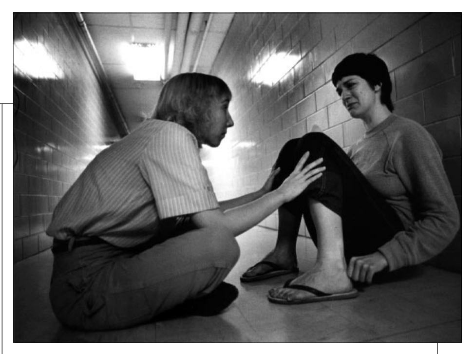
For victims of domestic violence, shelters can provide a temporary haven. Here a woman is comforted by a counselor.

The Minneapolis experiment and its replications reinforce an important lesson about social science research: Just as it is essential to ask the right questions at the outset of research, so it is essential to recognize that some questions already have answersanswers rooted in our values.