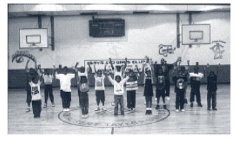
Children participate in athletic programs in the Club's six-rim gym.