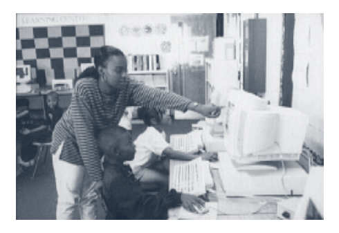
Children develop computer skills in the Club's computer room.

The younger children, ages 6–12, are allowed access to the Club from 2 p.m. until 6 p.m., and the older children are allowed to come in after 6 p.m. Director Dunkin explained the importance of separating older children from younger children. The younger children need to be protected from some of the older children's bad