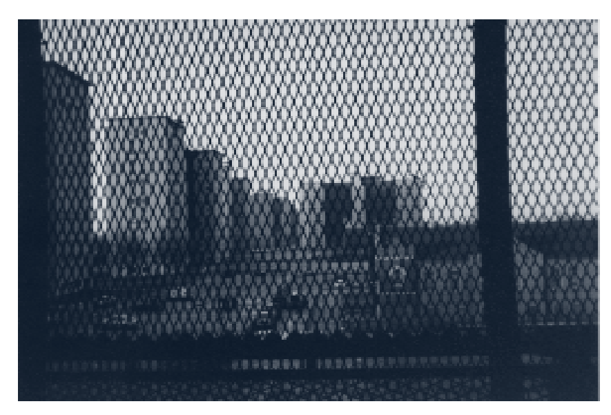
The main hallways of Robert Taylor highrises are open to the elements.

The physical conditions of Robert Taylor–B include obsolete mechanical and electrical systems, outdated elevators, leaking plumbing, inadequate security, deteriorating hot water tanks and heating riser systems, and an inadequate sanitary waste system. The building design includes open-air galleries on each floor that lead to weather exposure (a major cause of elevator breakdown) and high levels of criminal activity.<sup>4</sup>