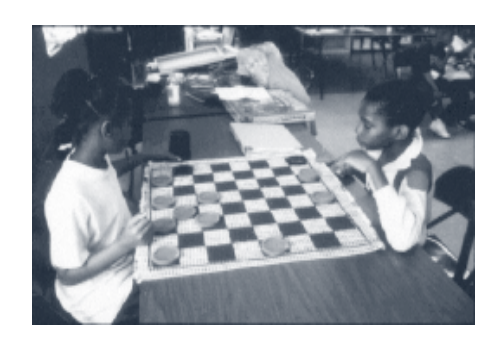
Children pass the time in a safe, warm, and learning environment.

We walked past the omnipresent person in the doorway to the next building where we walked through an unlit 15-foot tunnel and back into the elements again. These apparent "sentries" at every door just stood there, noting our presence. Ken stopped outside the next building in order for us to see the cables coming out of all the windows and connecting to the centrally located cable box like a giant thin legged spider clinging to the side of the building. "At least you get