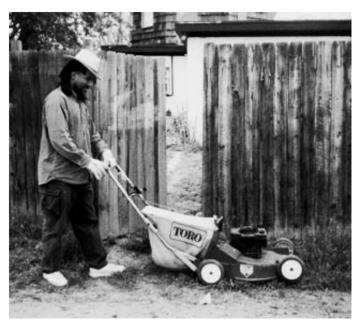
Residents played a vital role in Aurora's Championships of Alley Clean Up. The project led to the city paving all alleyways in the Aurora Weed and Seed target area.

In Aurora, alleyways exist primarily in the Weed and Seed target area; therefore their improvements became a major focal point of Aurora's Weed and Seed strategy from the beginning. Progress continues every day, evidenced in such efforts as the World Championships of Alley Clean Up, alleyway paving, the Can Can Project, and the Alleyway Lighting Program.