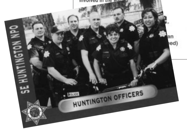
Sample card from the Southeast Fresno Weed and Seed Sports Cards Project, which has strengthened positive relations between police and youth in the Fresno area.