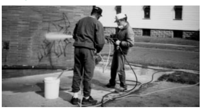
Rochester, New York