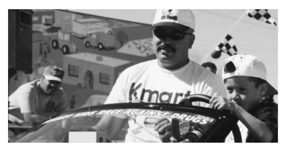
A youth gets driving advice from a volunteer "safety rider" during the Kmart Kids Race Against Drugs event in Tucson, Arizona.

In 1999, Westside Coalition Weed and Seed was preparing to enter into its first year of DEFY and was uncertain about how to fund the 12-month Phase II program. The Steering Committee didn't expect to participate in the DEFY program during its first year as an Officially Recognized Weed and Seed site, so the budget hadn't set aside any funds to support the program. In a lucky turn of events, the Arizona National Guard contacted the Steering Committee during the same week it was planning its DEFY efforts. It was a perfect marriage.