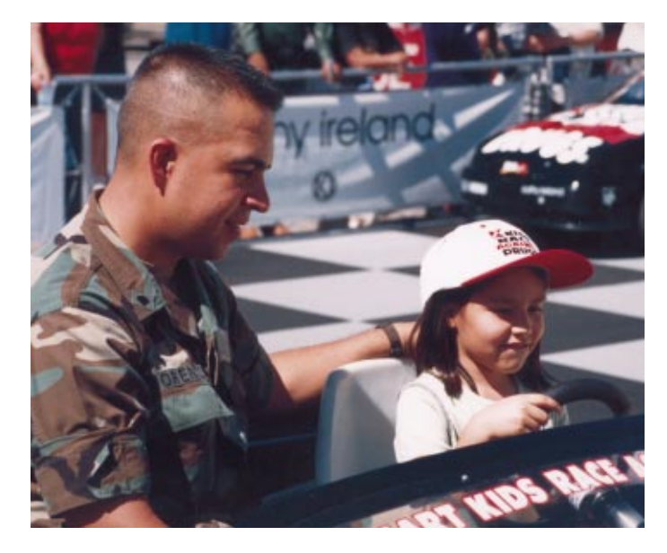
Arizona National Guard volunteers were on hand at the Kmart Kids Race Against Drugs event in Tucson, Arizona, to give lessons on drug prevention...and driving!

Early this year, Kmart and CADCA contacted Westside Coalition Weed and Seed to ask if they wanted to participate in future Kmart Kids Race Against Drugs events. Westside Coalition looks forward to the opportunity to send youth in the Weed and Seed target area a serious antidrug message while providing a fun event for the entire family.