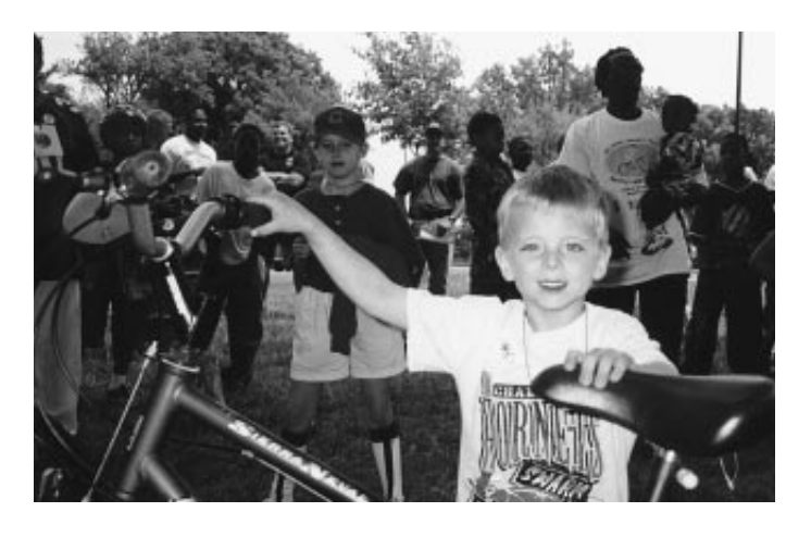
One happy youngster prepares for the bike safety course at the NESCO Second Annual Bike Safety Rodeo.

plans for the Third Annual Bike Safety Rodeo are already under way.