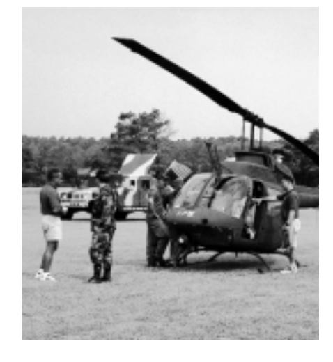
The Delaware National Guard brought a Recruiting Humm-Vee and helicopter to DEFY camp on August 8, 2000.

When planning a DEFY program, it is crucial that coordinators remember mistakes from past years and build on what has worked. DEFY