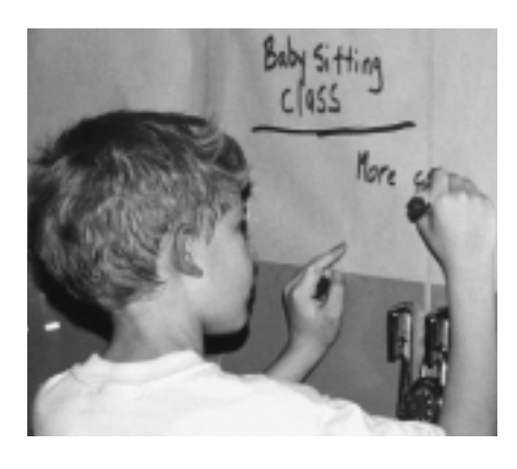
A youth writes ideas on the "planning wall."

With only a year for the program and dozens of suggestions, the number of activities that can be carried out is limited. Some popular suggestions