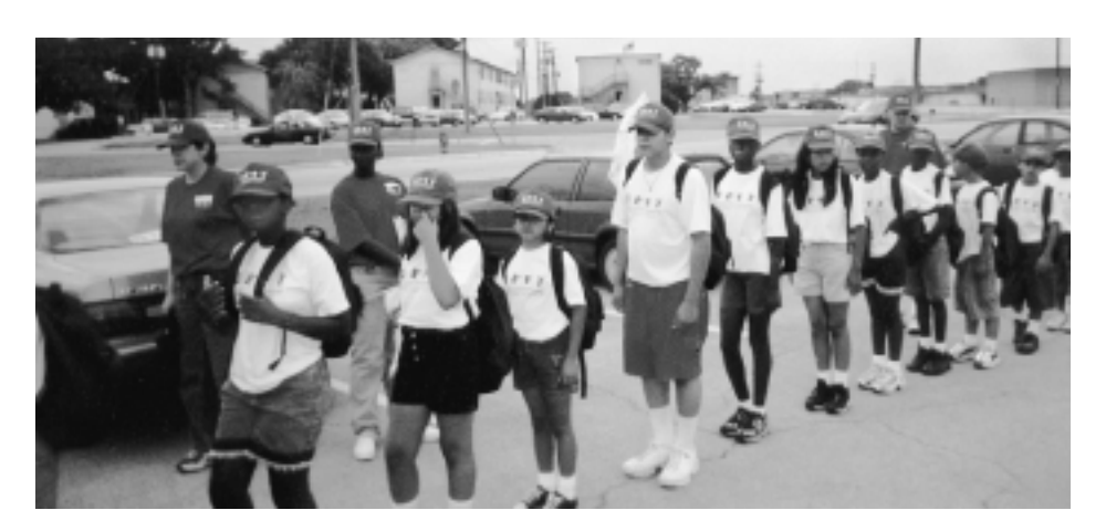
East Dallas Weed and Seed DEFY campers line up after morning colors.

DEFY participants were selected from each of the three Dallas Weed and Seed sites, as well as the Fort Worth site. The collaboration gave youth the opportunity to meet and interact with youth from neighboring communities while learning skills for achieving their life goals. For many of the mentors and other volunteer staff, the most enjoyable aspect of the camp was seeing how the kids changed in just 1 week as