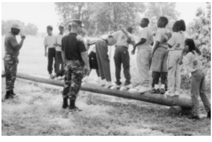
DEFY youth test their endurance and teamwork skills on the National Guard Ropes Challenge Course.

By graduation on Friday, both the youth and the camp staff experienced bittersweet moments of saying goodbye to new friends while looking forward to the adventures to come in Phase II.