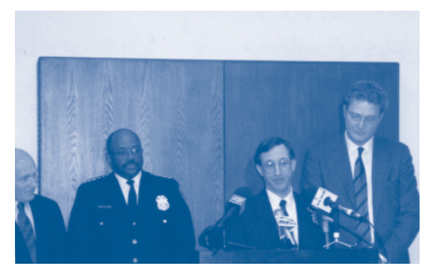
Announcement of the Safe and Sound Initiative.

leaders. This group came together to study the serious issue of youth crime and violence in Milwaukee and to develop collaborative options for addressing the problems. The task force developed a strategic plan for an expanded problem-solving approach in the highest crime areas of the city. A new public-private venture was recommended as the result