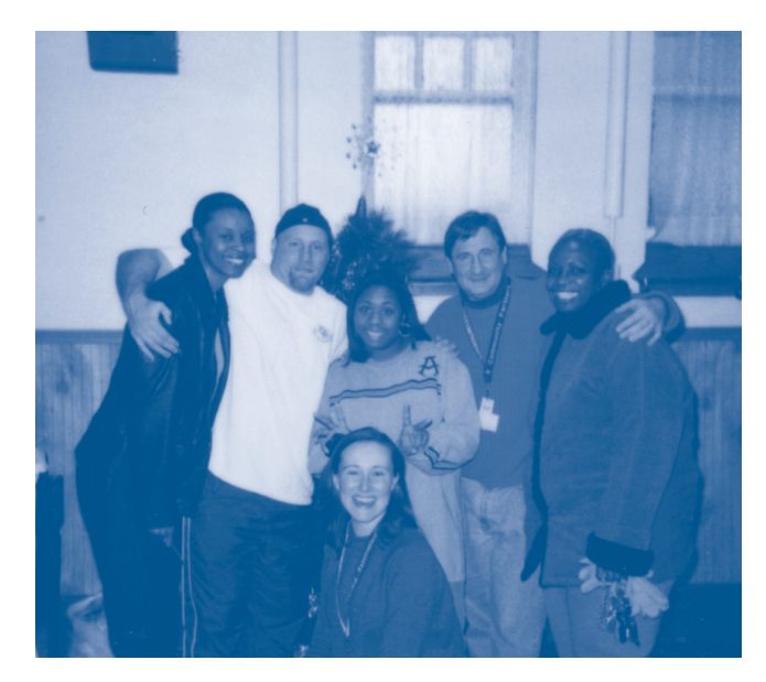
Six of the 20 Community Partners.

The community partners reflect the ethnic/racial diversity of the neighborhoods where they work.