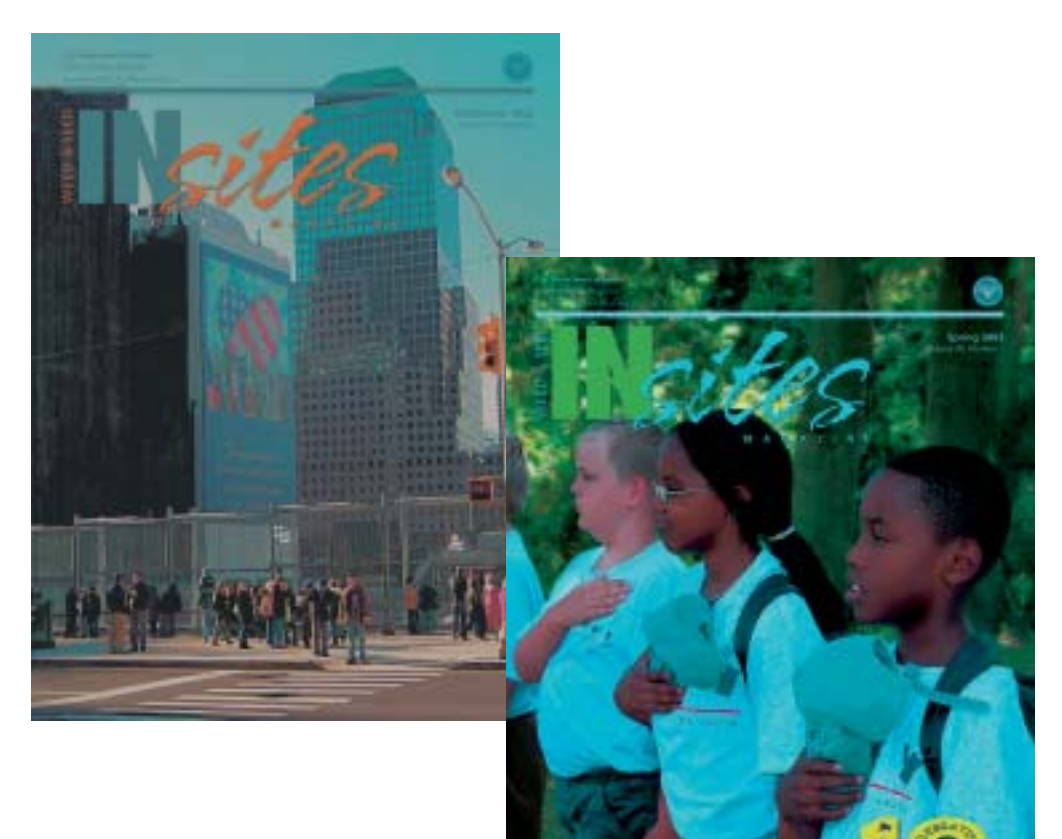
Don't miss an issue of In-Sites.

Weed and Seed is updating its subscription list. To ensure that you continue to receive In-Sites , fill out the form located on the EOWS Web site at www. ojp.usdoj.gov/eows and e-mail it to Insitesub@ojp. usdoj.gov.