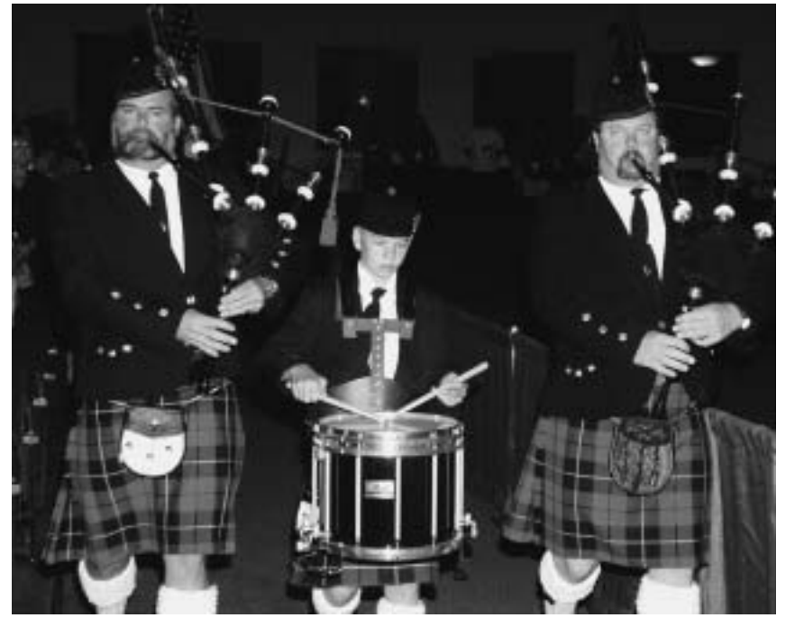
Performers at the opening ceremony festivities.