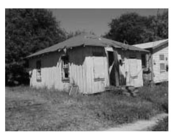
A typical abandoned home that is constantly being broken into and used by transients, drug users, and prostitutes.

Christi Police Department, and our local Weed and Seed office are represented on the board. Operation Clean Sweep, begun in 1998, is Neighborhood Visions' primary program.