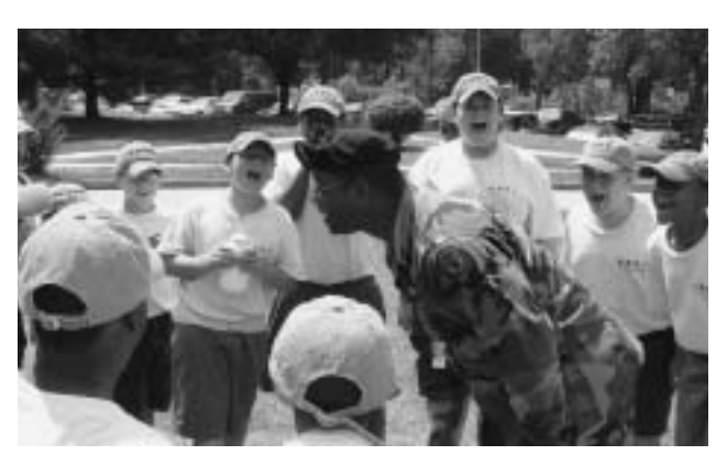
Learning values at DEFY camp in Annapolis, Maryland.

To learn more about the Navy's implementation of the DEFY program, visit its Web site at www.hq.navy.mil/defy.