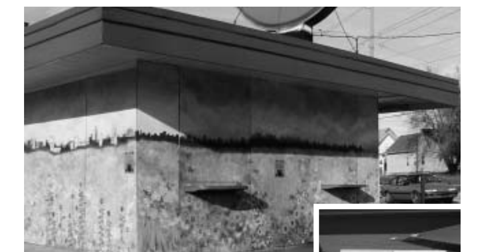
Above: The ice cream parlor decorated with its new mural. Right: The artist/mentor and her students.

The artist designed the mural and did the initial painting on the boards. Then she started a weekly summer art class at Girls Inc. and worked with a number of the 8- to 13-year-old girls who not only spent a part of their summer learning art but also finished painting the boards. The artist donated her time and got a local paint store to donate the paint. Even the installation of the boards was done with donated labor.