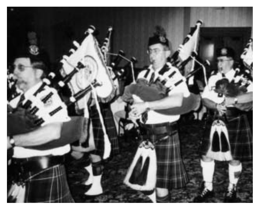
The Orlando Regimental Police and Fire Pipes and Drums.

Another initiative is the development of a coordinator's training module that will be presented at the national conference in Albuquerque, New Mexico, May 25–28, 2003. The development of this package acknowledges the importance of the coordinator's work and the need for strong support for the person in this position. This package will use state-of-the-art technology to provide access to