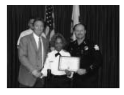
Fresno, California, Police Department Citizens at Patrol Induction ceremony.

Conducting checks on homes of residents away on vacation.