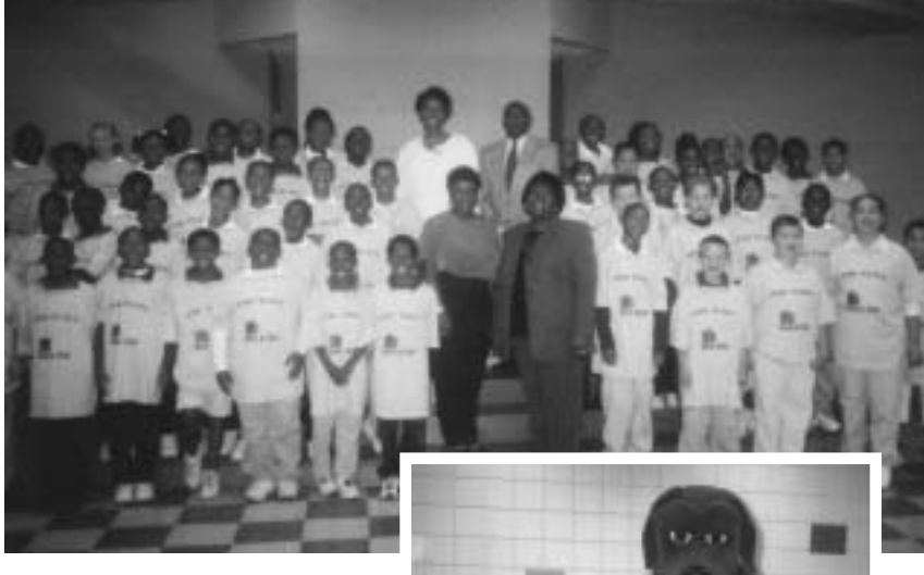
Pine Bluff poster contest participants wearing their Weed and Seed T-shirts.

Following the morning orientation about services provided by Weed and Seed, a fashion show was presented by the Jefferson County Workforce Alliance and Neighbor to Neighbor, Inc. It provided selected residents, who were identified by local nonprofit organizations as individuals in need of assistance, with clothing for job interviews. The free clothing was made available so that they would not have to turn down an interview for employment because they had nothing nice to wear.