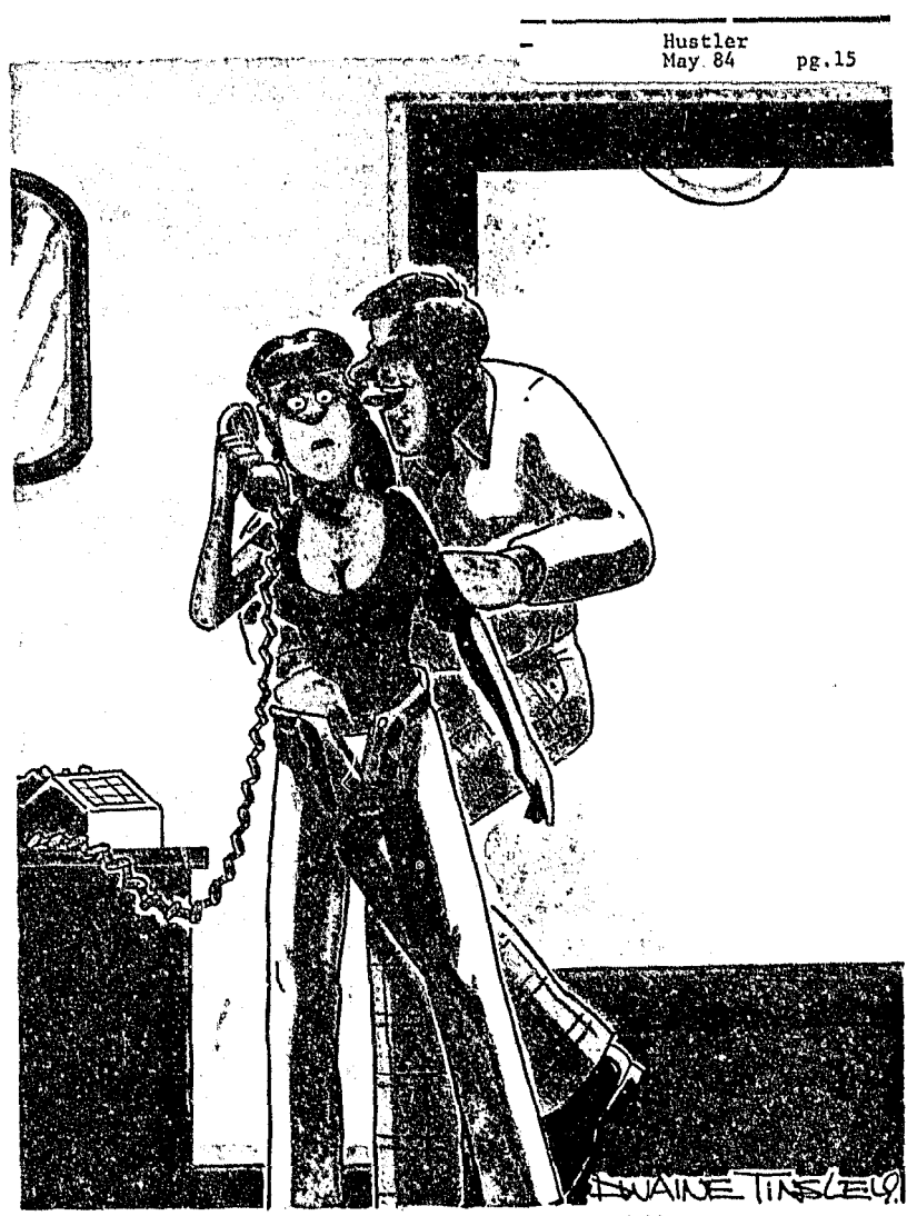
"Gee...1'd love to go to the drive-in, Tommy, but my dad has some, uh, extra household chores for me tonight."