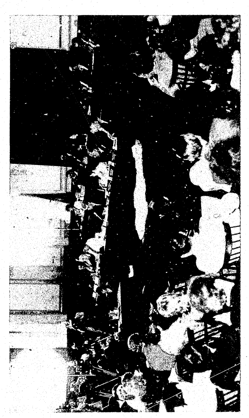
The Commission hears a witness's testimony.