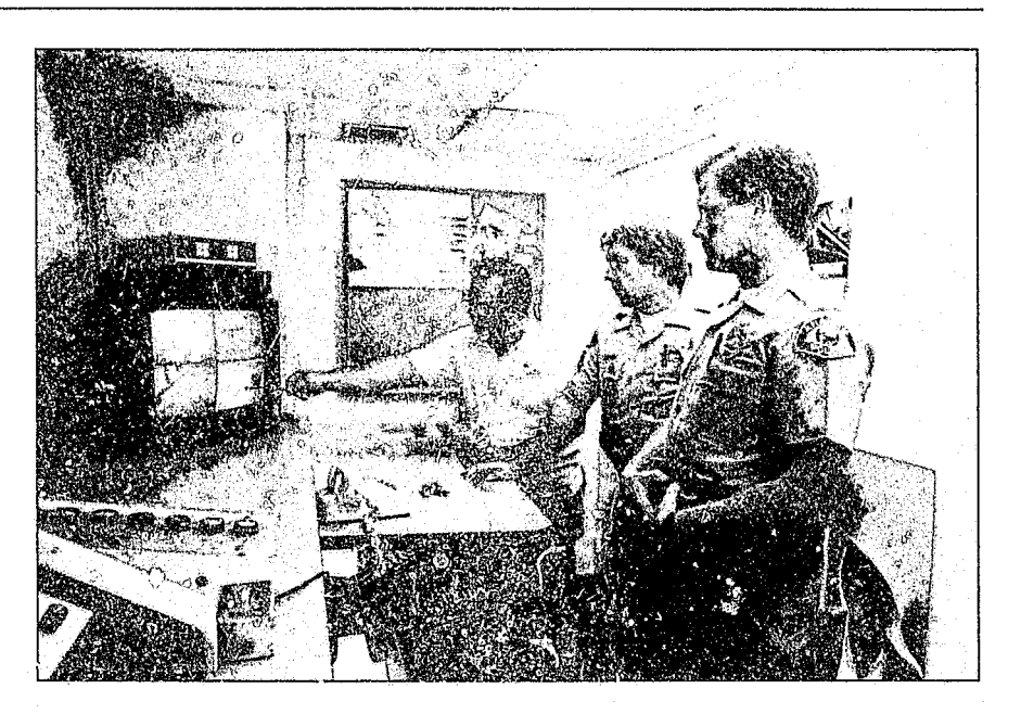
A four-camera video taping system is used to show the good and bad points of an officer's actions during the course.

"Documenting firearms training not only reduces liability for the city and department but is an excellent training medium."