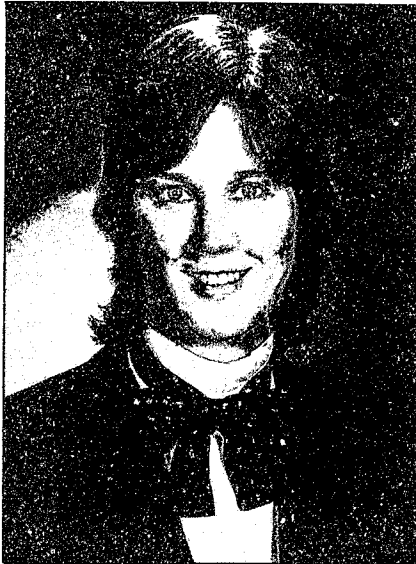
Special Agent Kingston

U.S. Supreme Court granted certiorari 7 to more closely examine the State's contention in light of previous decisions involving the "plain view" doctrine.