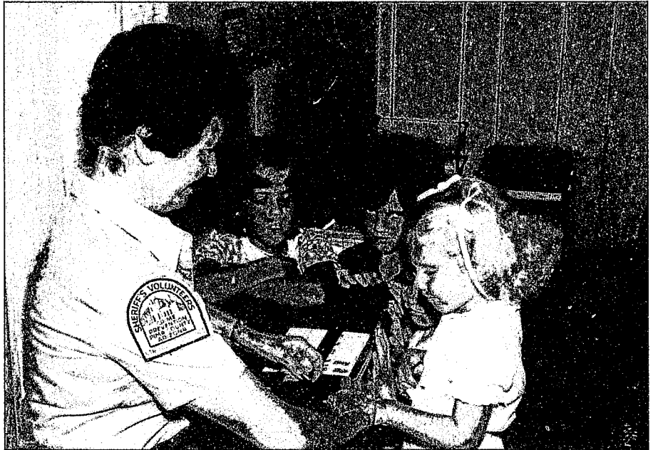
A sheriff's volunteer of Pima County, AZ, helps fingerprint children.