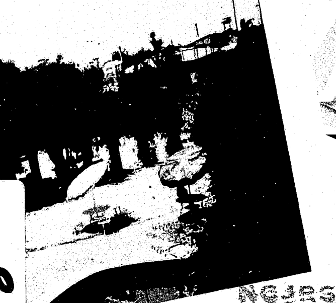
FIGURE 2 881 Lope De Vega Interior View of Grounds)