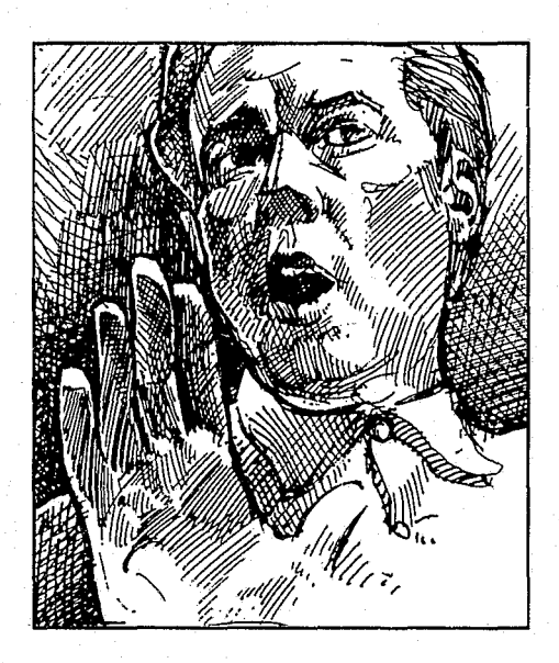
"Buying Used" for the Institution Library