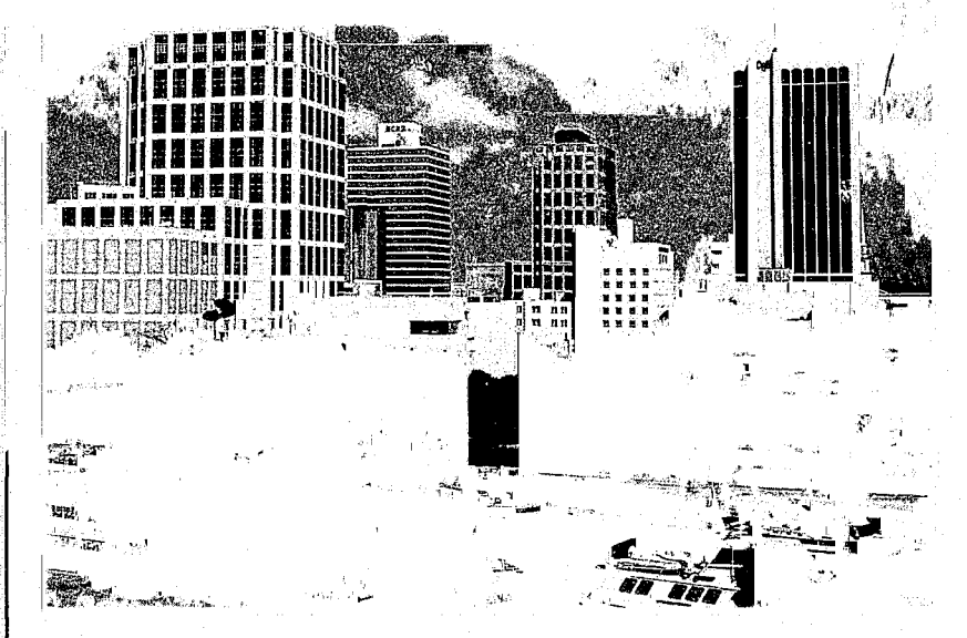
Ft. Lauderdale's Code Enforcement Team

<sup>15</sup> Similar questions asked to supervisors and managers attending the Michigan State Police training academy in 1990 and responses were very similar to those given in 1979 National Opinion Research Corporation study.