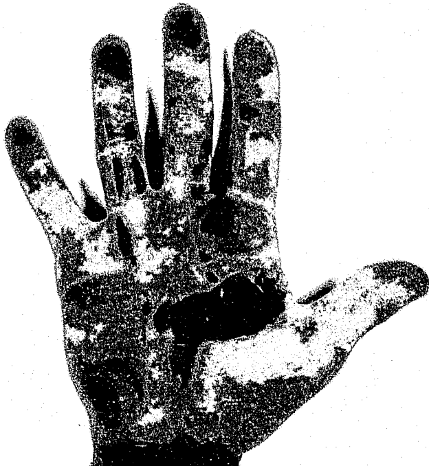
Figure 2. .25 Auto Pistol