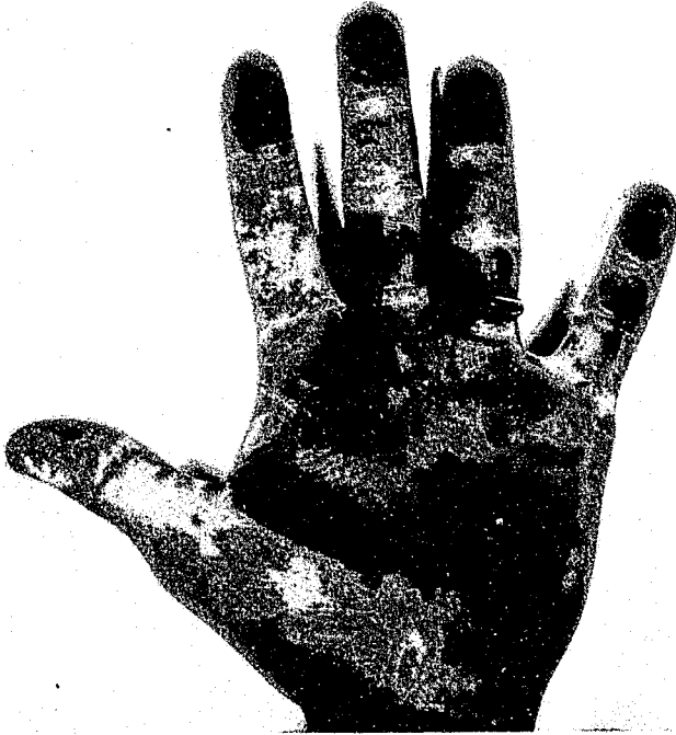
Figure 1. .38 Special Revolver.