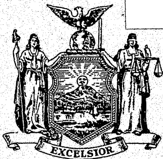
Mario M. Cuomo Governor

Further reproduction outside of the NCJRS system requires permission of the copyright owner.