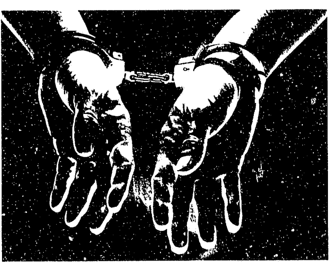
A tough new anti-drug police task force is now on the streets in Maricopa County enforcing our already tough drug laws. And if they catch you with drugs, they're taking you to jail. You then face felony charges, a prison sentence and stiff financial penalties. Or pay to enter a year-long rehab program. All of which means drugs are no longer the fashionable thing to do.