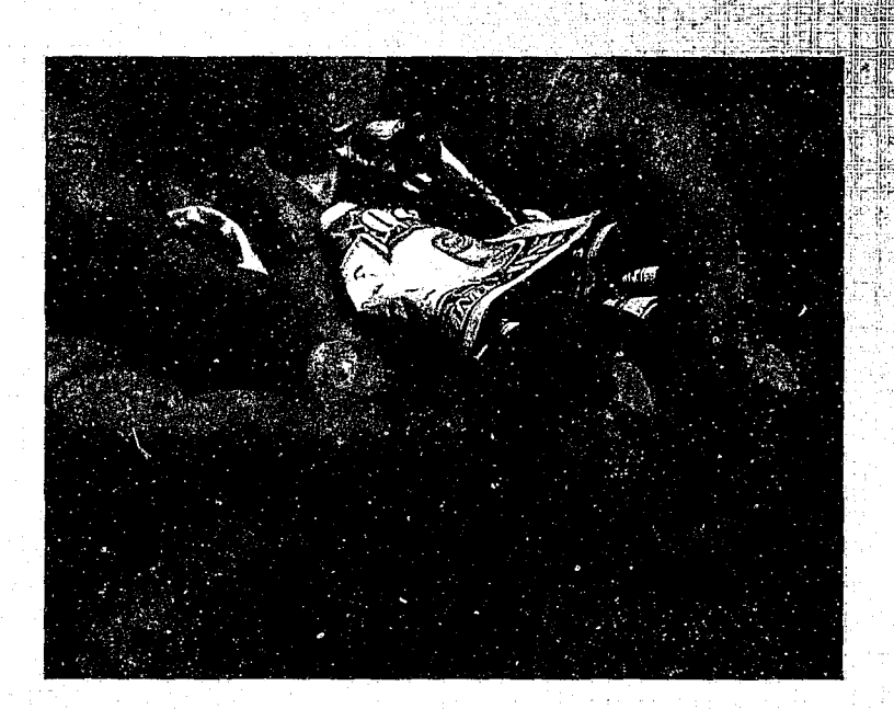
"Drug conspiracy constitutes a separate and distinct offense and does not depend on whether the subjects accomplished the conspiracy's objective—selling drugs."

Mail covers can accelerate and bolster the investigation by quickly