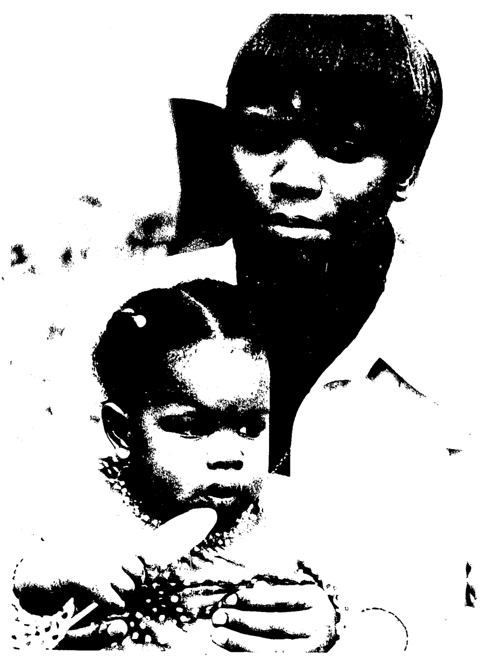
Most female offenders are poor, uneducated, unskilled, unmarried, have at least two children, and are minority group members.

process. In 1974 one of every six persons arrested was female. 23 According to the 1970 Bureau of Census report, 24 one of every 10 persons in jail—either awaiting trial or serving sentences of a year or less—was female, and only one of every 35 prison inmates was female. The Uniform Parole Reports indicate that in 1973 one of every 16 persons on parole after release from a state prison was female. And according to the U.S. Department of Health, Education and Welfare study of the juvenile justice system, 25 girls represent only 26 percent of the cases disposed of in 1973.