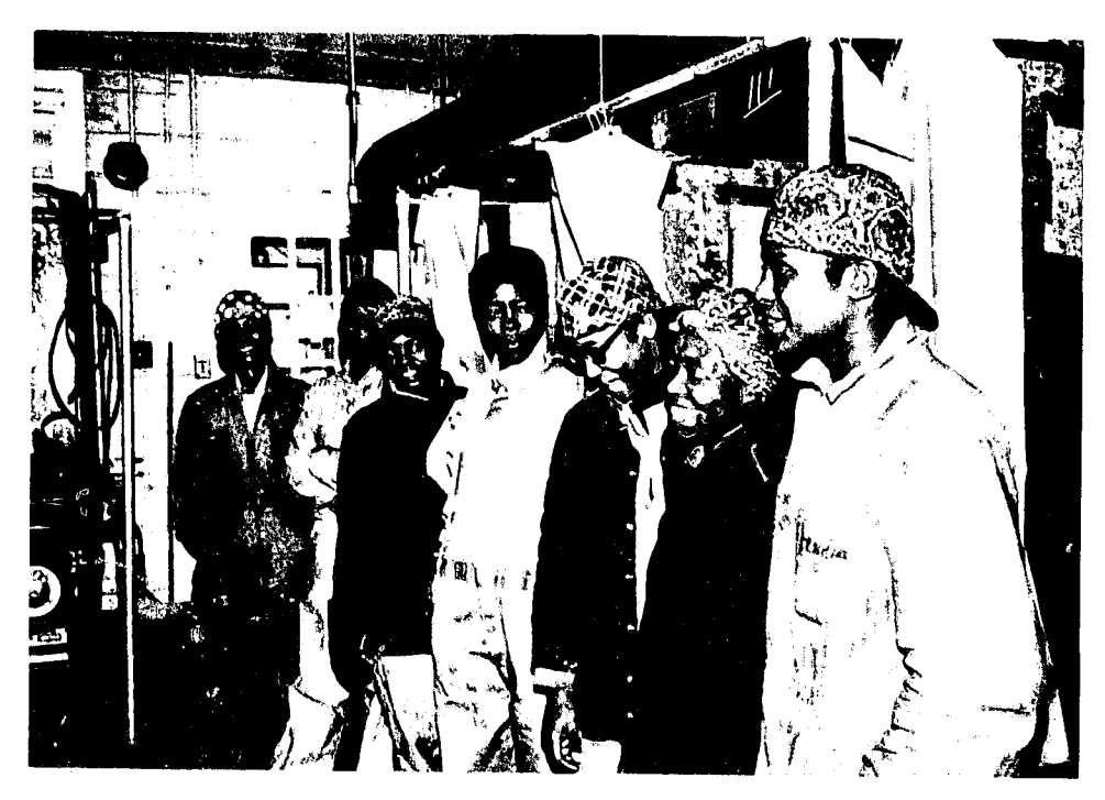
The welding course at the Maryland Correctional Institute for Women is one of the few existing programs which attempts to train and place women in traditionally male jobs where the pay scale is higher.

Twenty-five percent of the 101 women who completed questionnaires in the 1973 Oklahoma study wanted business-related training as secretaries, switchboard operators, bookkeepers, and the like. An additional 25 percent were interested in learning medical skills. Fifteen of the women wanted training in cosmetology and modeling, and eight wanted to learn technical trades such as welding, barbering and meat cutting.<sup>39</sup>