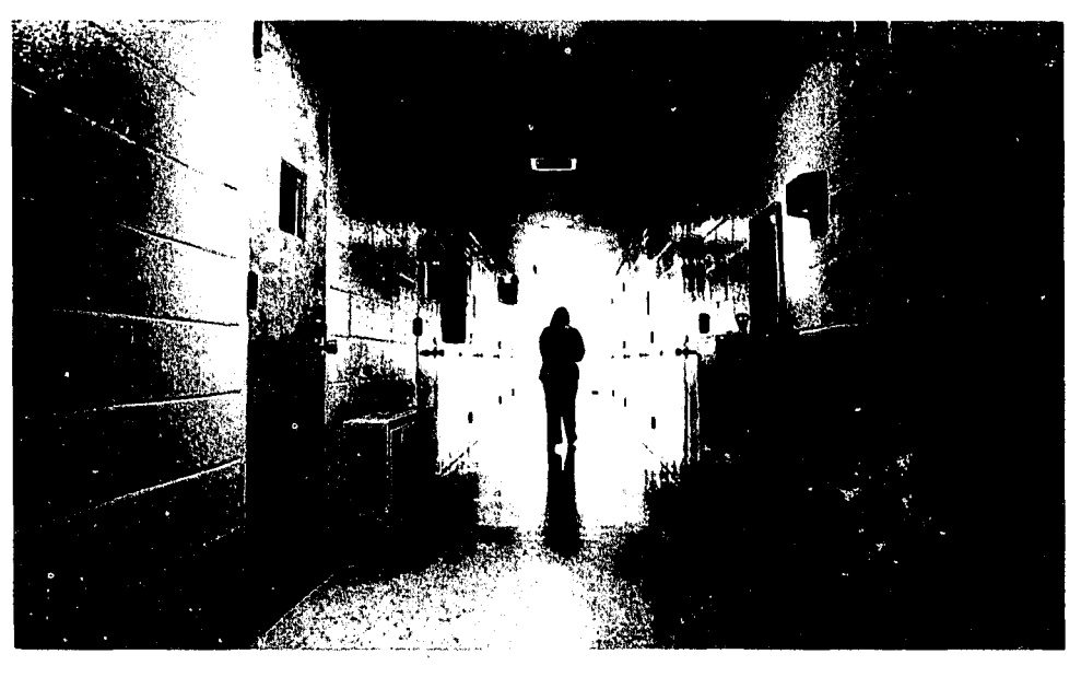
The most neglected female offenders are juveniles, women on probation, and those with drug and alcohol-related problems.

THE SEVENTH STEP FOUNDATION 407 South Dearborn Street Chicago, Illinois (312) 663-5290 Contact: Juanita P. Morris