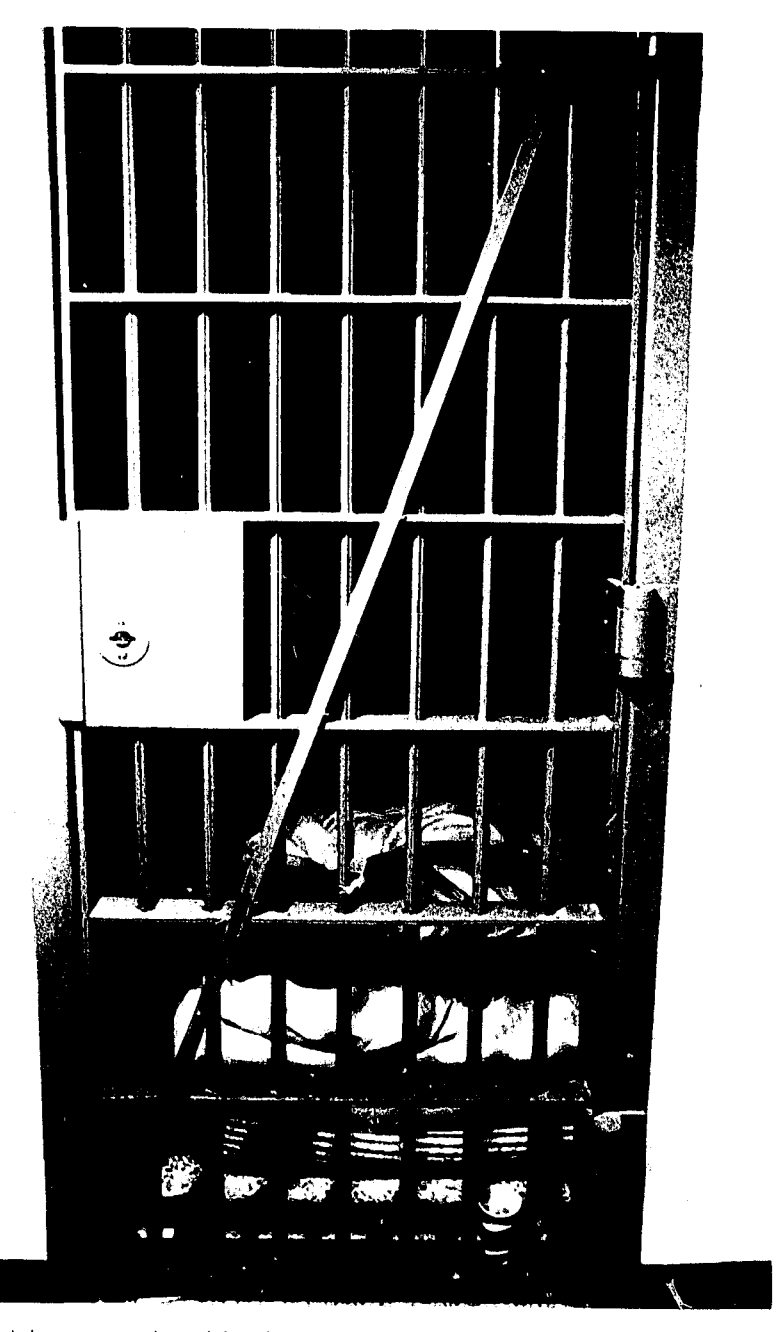
A large proportion of female offenders are detained in jails—most of which are overcrowded and lacking in services.

Arrest statistics indicate that economically motivated crimes involving women are increasing. Consequently, work release programs which provide women with training and employment opportunities are essential if their further involvement in crime is to be discouraged and discontinued. While statistics are limited, metropolitan areas report an increase in the number of female offenders who are drug addicted. Drug counselling and detoxification services are necessary in all correctional institutions.