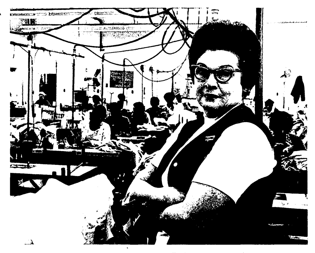
Typical training programs for female offenders in prison include sewing, cooking, laundering, cosmetology, cleaning and clerical duties—all low-paying jobs traditionally reserved for women.