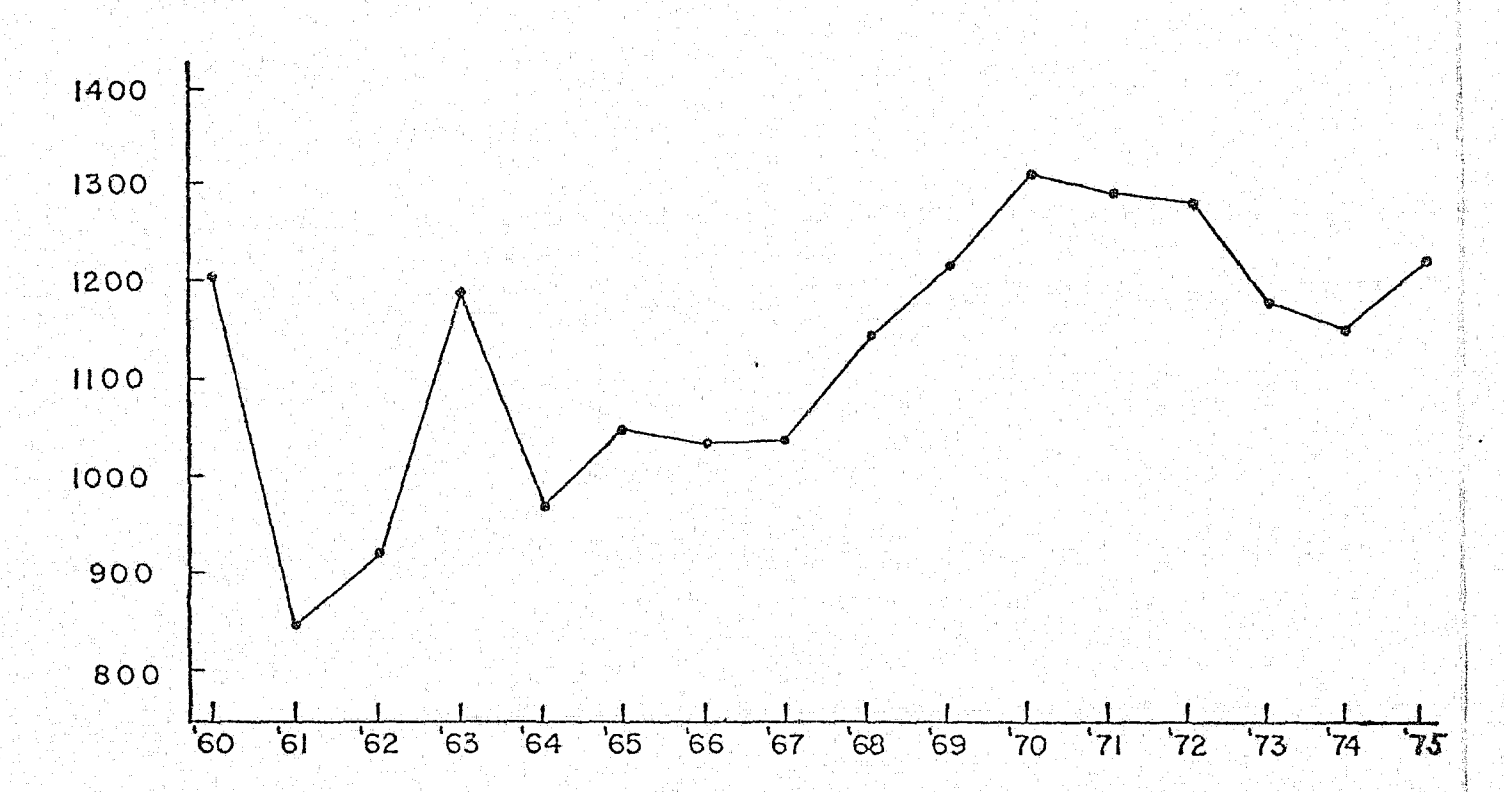
FREQUENCY DISTRIBUTION 8 PERCENT CHANGE PERCENT OF TOTAL LOCAL INDIVIDUAL ARRESTS