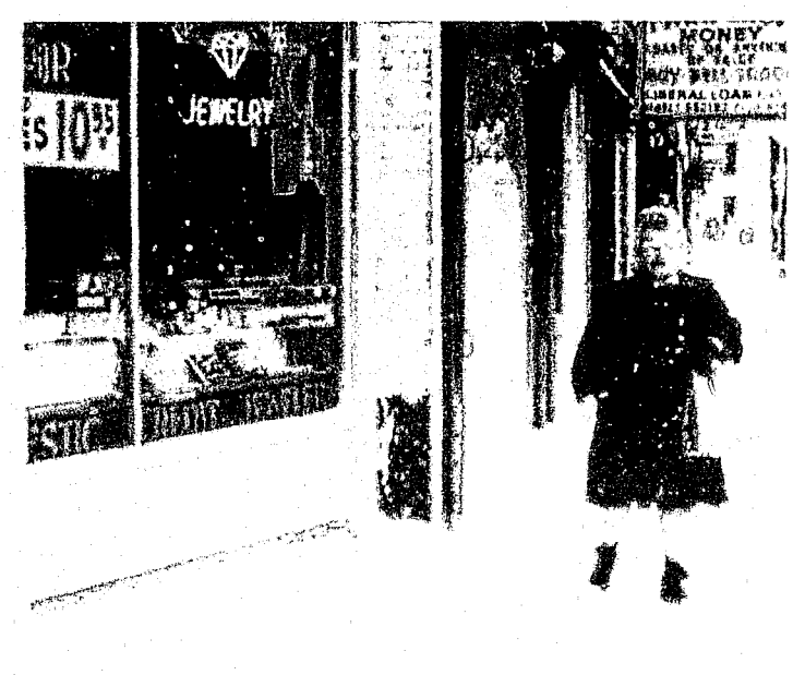
Above: A scene in "How to Avoid Street Attacks." A woman walking too close to buildings is within reach of lurking muggers.

"I think the seniors like the slide-shows because they are not frightening," she says. "Instead, they are educational and entertaining at the same time."