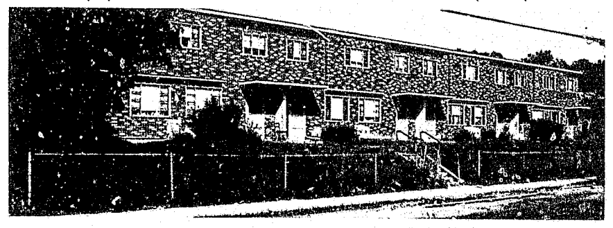
ABOVE-Millvale public housing before renovation. LEFT & BELOW-Attractive new design features deter crime while boosting residents' pride in their housing.

One such long-term solution was achieved when the architects converted the barrack-like housing into esthetic, individualized units by adding gable roofs and refurbishing building exteriors. This setting provides