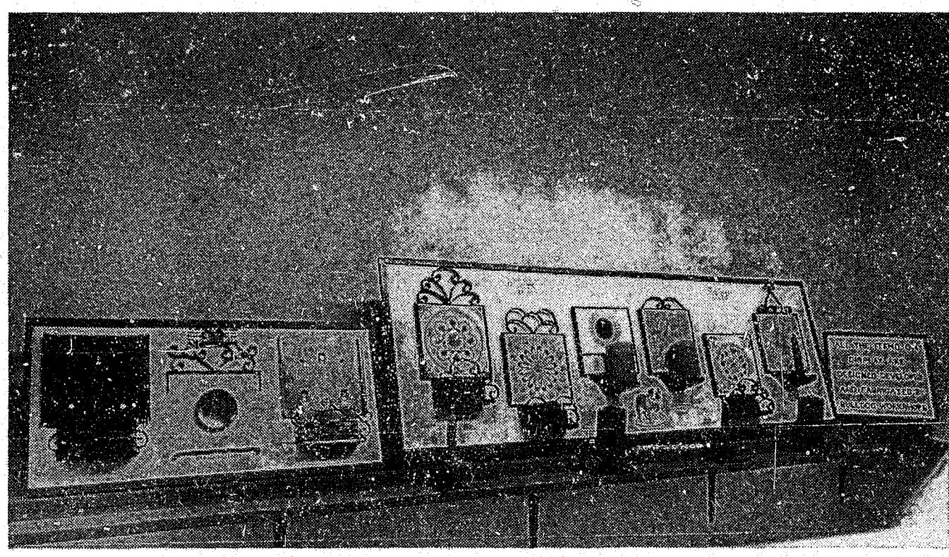
A display of articles produced in the workshop