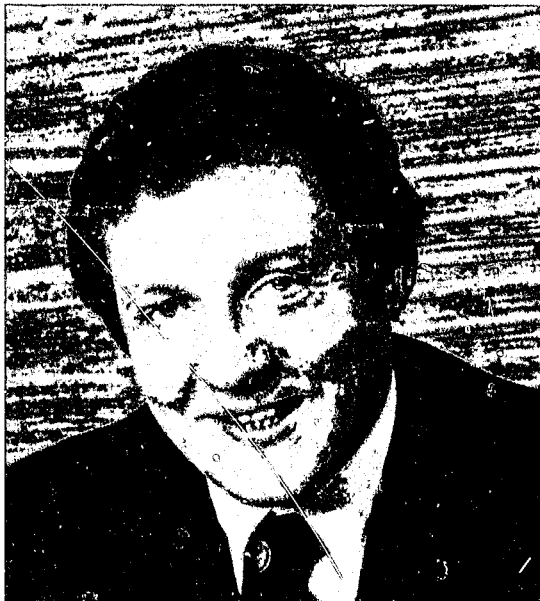
R. Roy McMurtry, Q.C.