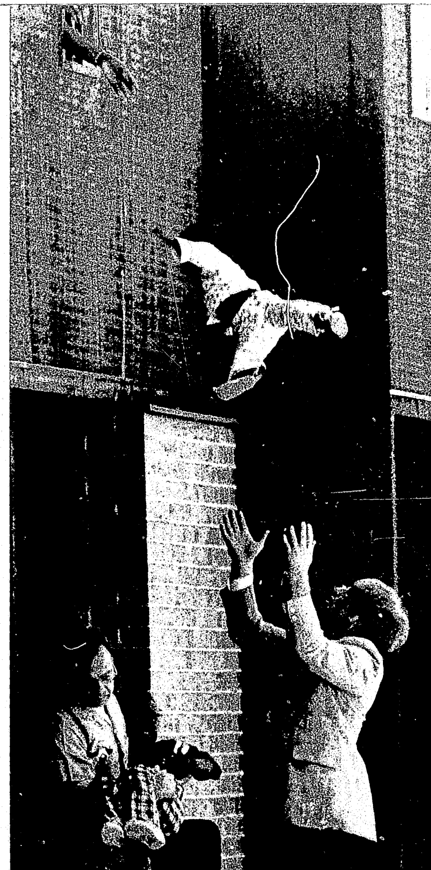
FBI Agents rescue two children who were held hostage.

Communication between media and law enforcement tends to strengthen the trust between the two. As one police chief stated in a nationwide survey, "On-scene liaison between police and media and a policy of department-wide openness promotes a climate of mutual trust and understanding wherein the police and the media can fulfill their respective obligation to the public." 18 The time for communication with the media, however, comes long before the crisis occurs. The chief of police in Warrensville Heights, Ohio, who was involved in a hostage/terrorist situation, says that until that crisis he had never really spent a whole lot of time with members of the media. Now he believes in establishing an on-going relationship with them. "The key is common sense and