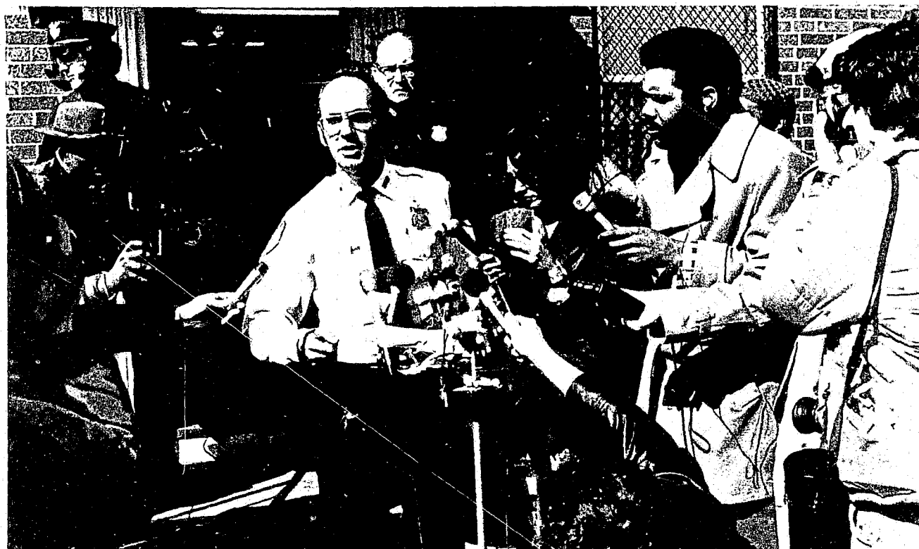
Warrensville Heights police chief briefs members of the news media.

cooperation between media and law enforcement," said the FBI Special Agent in Charge during the Warrensville Heights case. 20 Building a good rapport with the media—one based on forthrightness, openness, and trust—long before the hostage taker ever strikes is a necessity.