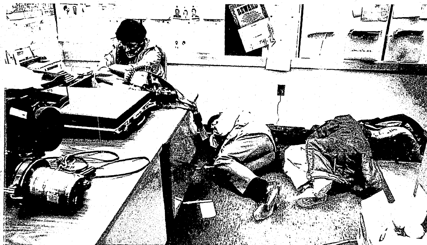
During a recent hostage/terrorist situation, exhausted newsmen catch up on much-needed sleep.

When the crisis situation comes, the PIO should be one of the first on the scene. His job at the scene is to ascertain immediately the facts and report to the media the who, what, when, where, why, and how of the situation in a general briefing, so that the entire press corps can get the truth from a reliable police official, hopefully eliminating the need for freelancing by the media.