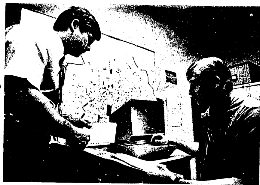
Investigators checking account numbers through

The greater majority of prosecutions for fraudulent use of bank cards is handled by local city, county, and State prosecuting authorities, who will usually require a written police report. Many prosecutors will accept well-prepared reports of experience bank card security investigators, along with reports of investigating police officers.