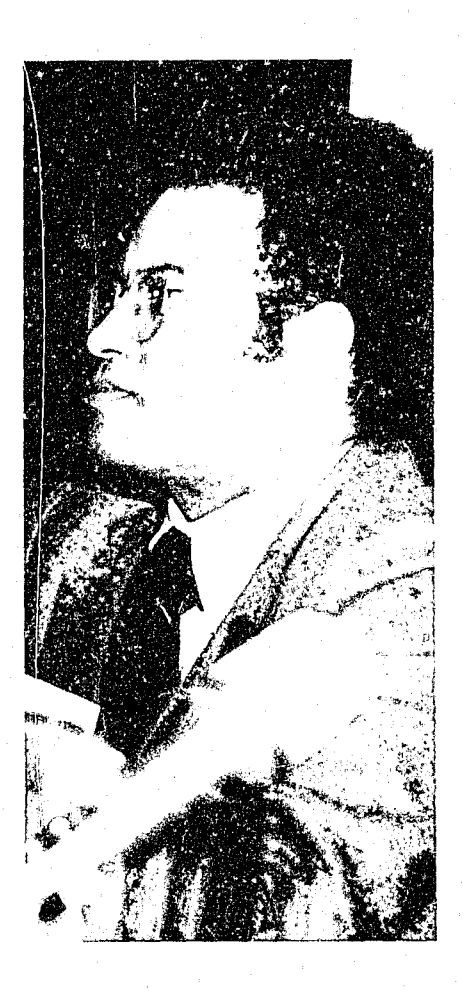
Drew S. Days III-

And finally LEAA's most recent funding is this national conference. Our hope is that this is the thrust that spearheads a national strategy to deal effective with this highly sensitive and cruical issue.