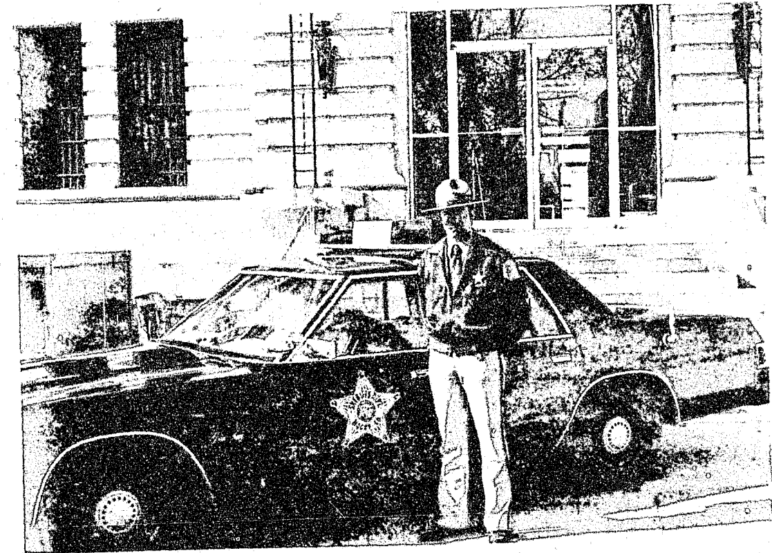
Moody County contract law enforcement patrol unit.