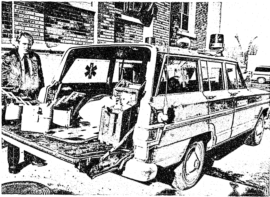
Vehicle purchased by Edmunds County Cooperative Law Enforcement program.

There are also county-wide law enforcement programs operating at the present time in South Dakota. Both Moody and Sully Counties have one law enforcement department to provide services for the entire county. The sheriffs of the counties are in charge of the operation. In addition, each county has a law enforcement advisory board with representatives from the cities and the county. As mentioned earlier, this advisory board provides the vehicle for enhancing communication which is so all-important to the successful implementation of a cooperative effort.