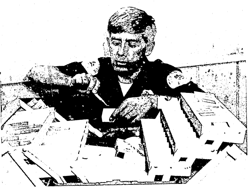
Above: Evidence collection methods and proper use of equipment are taught to UCI personnel.

Left: Crime scene photography is a major function of the uniformed crime investigator.