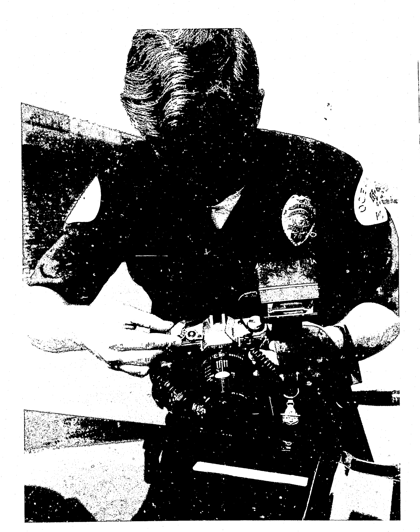
"Training is the backbone of a successful UCI program—extensive training at the beginning, ongoing training as the program develops."