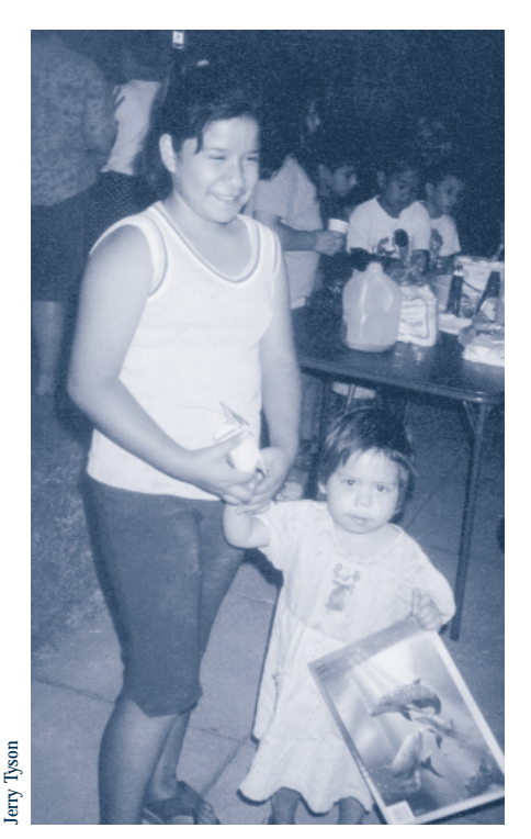
Proud winners of the chalk-drawing contest on the 400 block of East Oak Street in Lodi.

Lodi has an extraordinary spirit of volunteerism. Despite its small size, the city has 180 active neighborhood watch groups, and this year organized 126 block parties—some of them large enough to accommodate more than one group. There are dozens of stories about their accomplishments—a car burglar thwarted in one neighborhood, a thief identified and arrested in another—but the story Lodians tell most often is about a