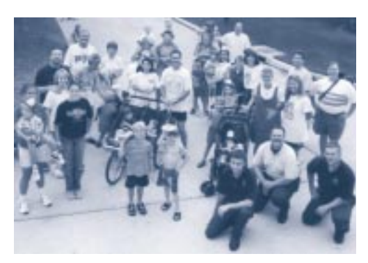
National Night Out block party in the Cedar Grove neighborhood in The Woodlands, Texas (see page 10).

The occasion was National Night Out (NNO). A young man in Philadelphia named Matt Peskin recently had launched this new crime prevention program as a way for people to begin taking back their neighborhoods by gathering in the streets one summer night each year, turning on their house and porch lights, and celebrating