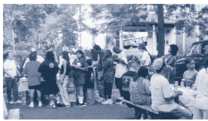
The Phillips neighborhood of Minneapolis comes together on the 2500 block of 16th Avenue South.

activists, told success stories of overcoming the tragedy of a neighborhood murder and victories in combating burglary, drug dealing, prostitution, petty theft, traffic