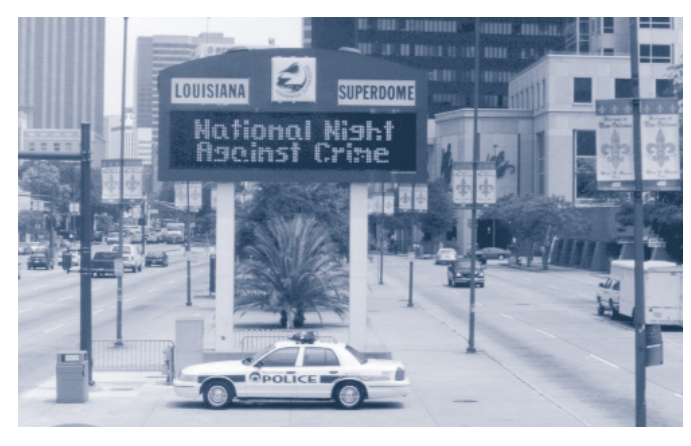
In New Orleans, the Louisiana Superdome's electronic billboard advertises National Night Out events.

"Zhoo...Way...Noh...Dig" read the brightly colored poster, one of many