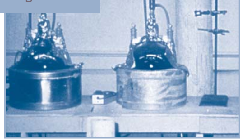
A CenTF training program teaches law enforcement officers how to identify and respond to illegal methamphetamine labs.