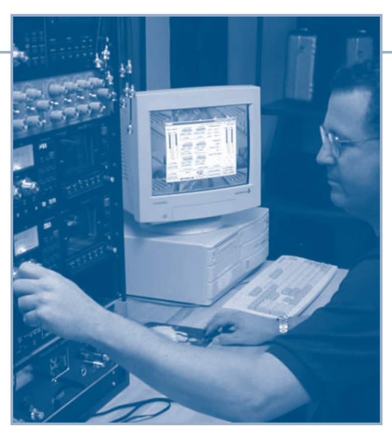
An equipment specialist at the Mid-States Organized Crime Information Center uses an audio-filtering console to filter audiotape recordings provided by member agencies.