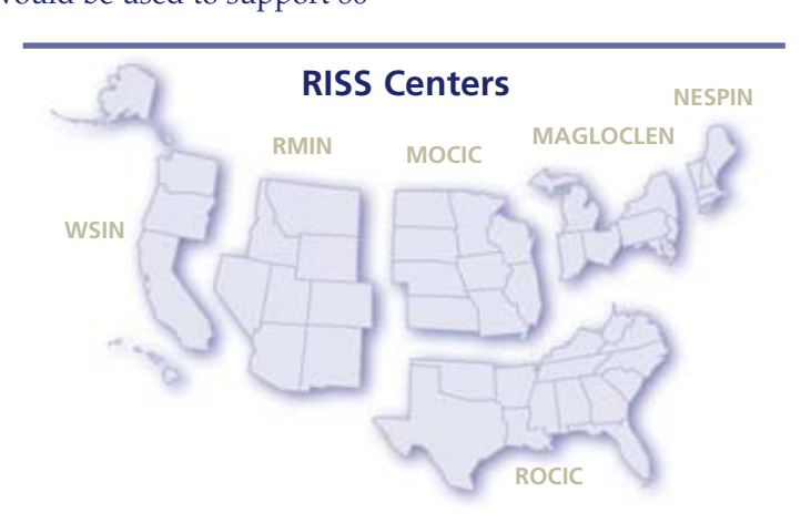
MAGLOCLEN, Middle Atlantic-Great Lakes Organized Crime Law Enforcement Network; MOCIC, Mid-States Organized Crime Information Center; NESPIN, New England State Police Information Network; ROCIC, Regional Organized Crime Information Center; RMIN, Rocky Mountain Information Network; WSIN, Western States Information Network.

forensics-related projects. A map identifying all LLEBG projects throughout the nation is available on BJA's web site at www.ojp.usdoj. gov/BJA/grant/llebg_app.html.