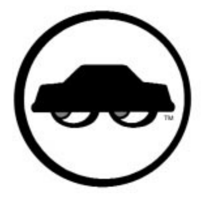
Figure 2. Rear window decal

Motorists can have the decal depicted in figure 3 applied next to the decal for the early morning hours program. This is the international borders/ports decal and is highly visible to border inspectors and law enforcement personnel who monitor traffic at border crossings and ports.