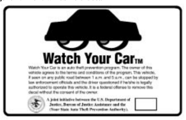
Figure 1. Front windshield decal

The rear window decal depicted in figure 2 contains no written information but simply serves as a beacon to law enforcement officers that the vehicle is registered in the Watch Your Car Program.