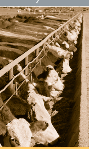
Agroterrorism—Why We're Not Ready: A Look at the Role of Law Enforcement