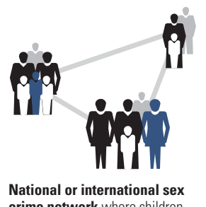
crime network where children are trafficked and marketed as commodities.