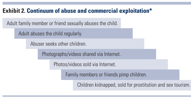
*Based on numerous case histories.

Eventually, pimps use the children's emotional and financial dependency to coerce them into selling sex for money that is turned over to the pimp. In time, the relationship becomes less emotional and more "contractual" as the pimp sets a minimum on the child's earnings. In one case, for example, a pimp recruited girls from Vancouver, British Columbia, and took them to Hawaii, withholding their papers so they could not leave. The girls were drugged,