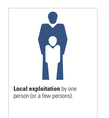
Exhibit 3. Organization of commercial sexual exploitation of children

Exhibit 3, "Organization of commercial sexual exploitation of children," illustrates the organizational structures of CSEC.