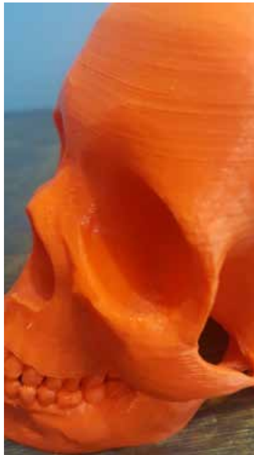
Exhibit 5. 3D Printing Striations

Note: This close-up shows the striations present in all 3D-printed objects.