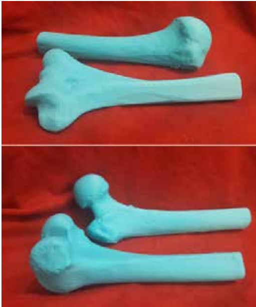
Exhibit 3. Humerus and Femur Prints with an FDM Printer

Note: Bones like these can be used in court to show how two pieces fit together instead of showing graphic photos.