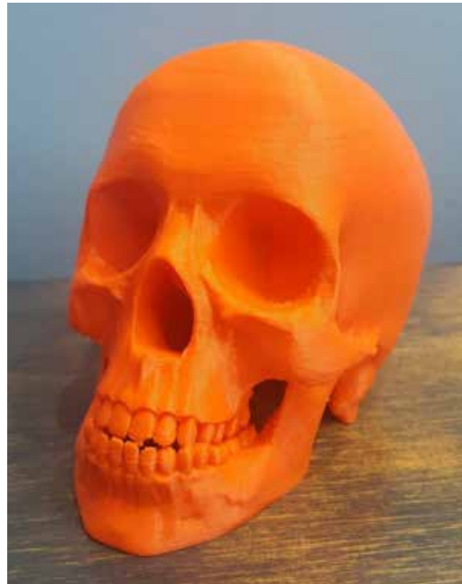
Exhibit 4. 3D-Printed Skull

Note: Printed skulls like this one can be used for facial reconstructions to minimize damage to the real skull.