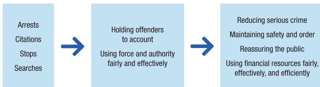
Figure 2. Exercises of police authority are directly connected to policing’s bottom line

Of crucial importance is that these basic components of police performance correspond to nearly all of the bottom-line outcomes of policing. One way of illustrating the relationships is presented in figure 2.