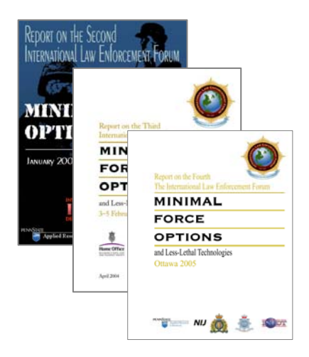
Previous ILEF Reports

Participation in these forums, as in previous years, has been by invitation and has assembled internationally recognized subject matter experts, chiefly practitioners from law enforcement, together with technical and medical