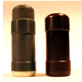
Attenuating Energy Projectile or AEP (left) and the L21A1 Baton Round (right)