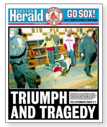
Front page of the Boston Herald after impact rounds were used for public order and resulted in a death.

In the immediate aftermath of a fatal shooting, a chief of police often wants to use the quick headline and say, "we would never use a less-lethal device in a deadly force scenario." However for every rule there is an exception and there