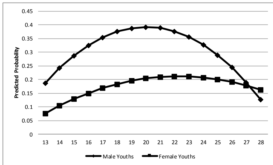
Figure 2. Age curve for IPV victimization by gender from age 13 to 28.

Longitudinal examination of relationship quality (assessed using indicators of frequency of disagreements, trust, and jealousy) and continuity revealed that IPV experiences demonstrated patterns of greater variability than stability across adolescence and young adulthood. While more than half of respondents reported at least one IPV experience, only a small percentage reported IPV across all study waves. Consistent with the view that development of adolescent and young adult relationships follows a sequential progression (Connolly & McIsaac, 2009), relationships increased in trust and intimacy, while decreasing in relationship churning (breaking up and getting back together). These patterns were associated with a lower proportion of relationships with IPV, supporting the notion of a relationship learning curve (Giordano et al., forthcoming) in which young adults draw on the full breadth of relationship experiences to inform future choices such as stay/leave decisions, developing criteria for the selection of a new partner, and creating boundaries regarding behavior within the relationship.