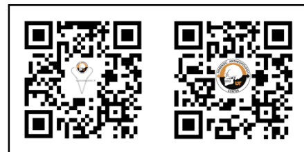
Figure 2. DCP 2.0 manual in pdf format (right) and instructional video (left).