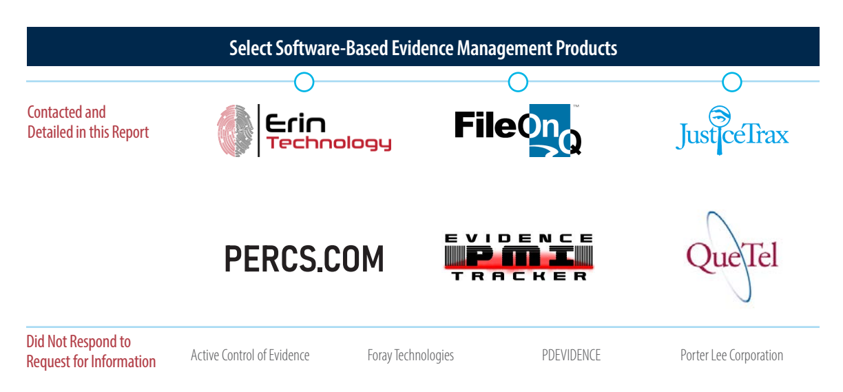
Figure 1: Selected software-based evidence management products were considered and compared for this report; the landscape of products is large, and this set comprises companies that responded to a public request for information (RFI), are market leaders, or had some aspect of interest in the subject of property management.

CJTEC consulted P&E experts—including those who use software-based management systems—and software vendors to understand needs, key value-adding features, commercially available products, and considerations for adopting these solutions. This report will help agency decision-makers understand how these systems can provide value and identify important questions to ask prior to implementation. Product tables compare selected products, capture insights from end users, and highlight use cases. Self-assessment questions support planning, procurement, and implementation. Figure 1 lists the standalone software systems considered in this report.