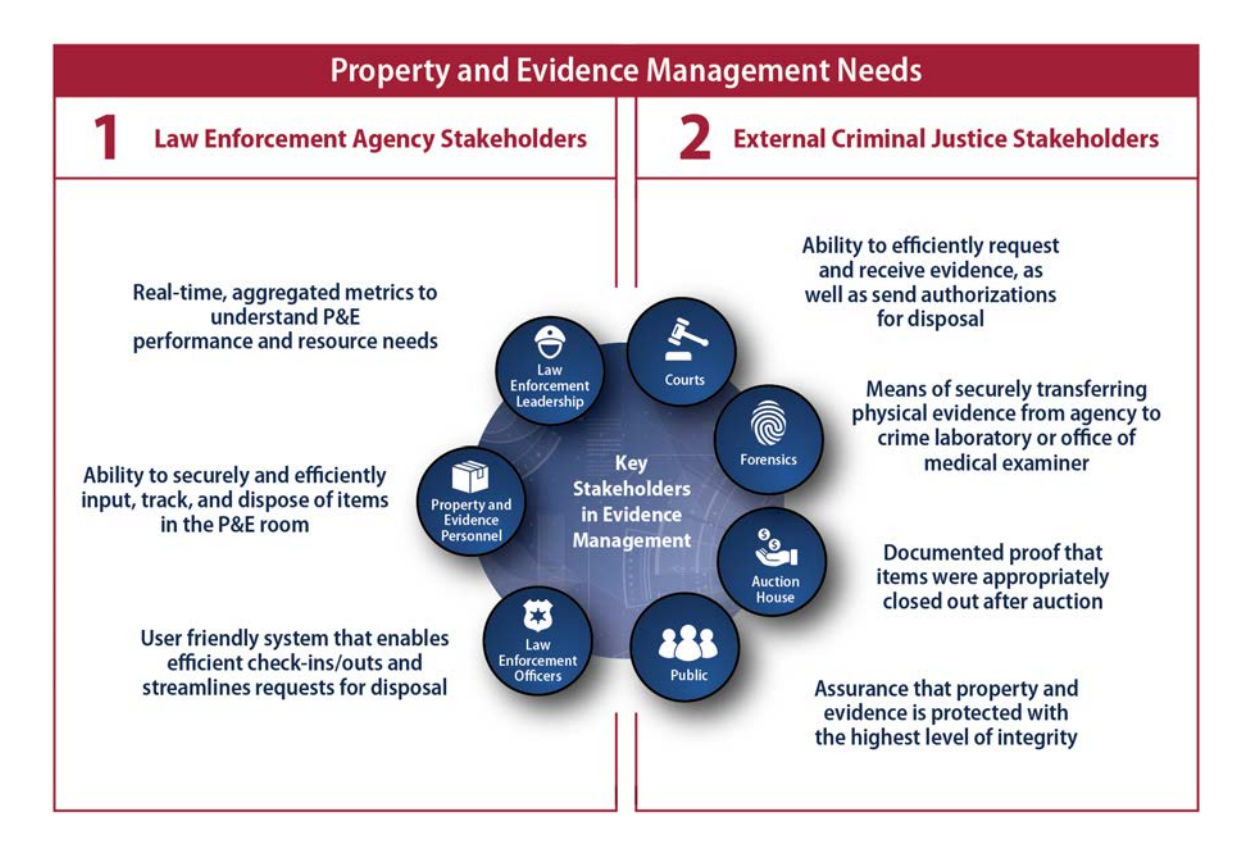
Figure 4: Many criminal justice stakeholders interact with evidence and share similar needs for systems to effectively manage this evidence.

During its lifecycle, evidence may be physically transferred into the custody of multiple stakeholders such as law enforcement agencies, forensic laboratories, courts, and prosecutors' offices. P&E personnel in law enforcement agencies often serve as primary evidence custodians, and many criminal justice stakeholders interact with evidence in different ways, as shown by Figure 4 . To effectively manage evidence, these stakeholders need systems that (1) secure and maintain evidence integrity and prevent theft; (2) track down relevant information and dispose of evidence in an efficient manner to free up space in the P&E room; and (3) provide access to information for software users, agency leadership, and external stakeholders that request information from the P&E room.