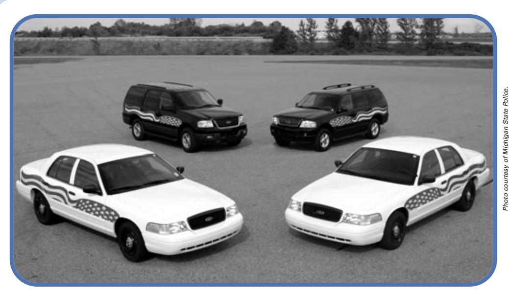
Ford Motor Company submitted the Police Interceptor (front), the Expedition (left rear), and the Explorer (right rear) for testing.