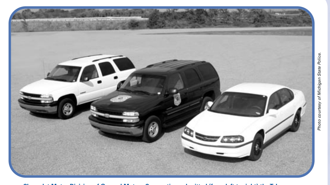
Chevrolet Motor Division of General Motors Corporation submitted (from left to right) the Tahoe (4WD and 2WD) and the Impala for testing.

Note: Scores are the total points the automobile received for each of the 29 attributes the MSP considers important in determining the acceptability of the vehicle as a patrol car—for example, front seat adjustability, clarity of instrumentation, and front and back visibility. The higher the number, the better the vehicle scored.